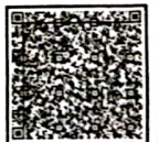
(Archana Badhe - Naware) I/c Registrar